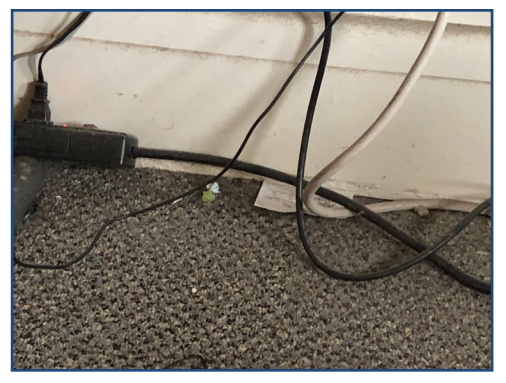
Figure 1: Loaded power strip plugged (or "daisy-chained") into another loaded power strip.