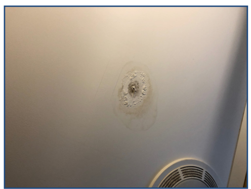
Figure 2: Water damage/possible mold.