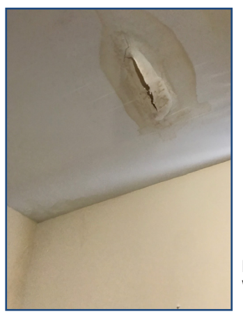
Figure 3: Water damage.

Most of the deficiencies (46 of 50) that were previously identified on the most recent Improvement Plans have been corrected.