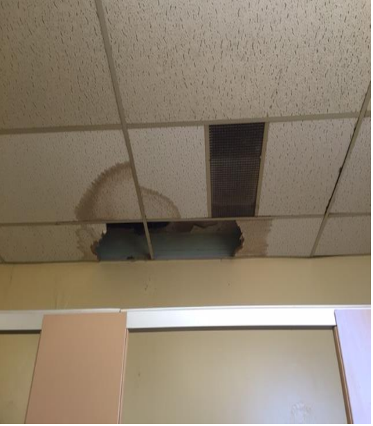
WATER DAMAGED CEILING TILES