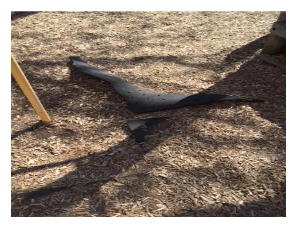
POTENTIAL PLAYGROUND TRIPPING HAZARD

In other cases, the problems could be easily solved through greater awareness and better safety practices, such as the secure storage of cleaning supplies, which we found under a sink in an unlocked cabinet within a child's reach.