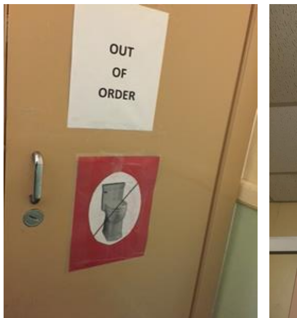
CLOSED BATHROOM STALL